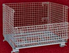
Wire Mesh Containers