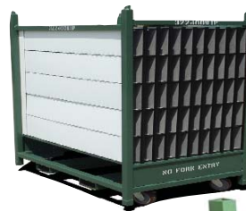
Left: Bag rack used to transport and store auto trim parts.