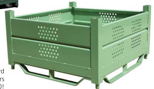
Right: SMF Ford container. AWP offers SMF models 1-10!