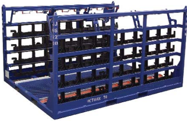
Above: Instrument panel rack.

Importantly, your product will be held securely if transporting over the road or while in the warehouse moving from assembly line to another line or to storage.