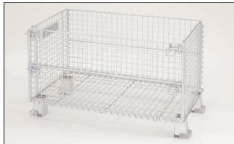
Above: Wire Mesh Folding Junior Container with 1" x 1" mesh. Gate is not folded.