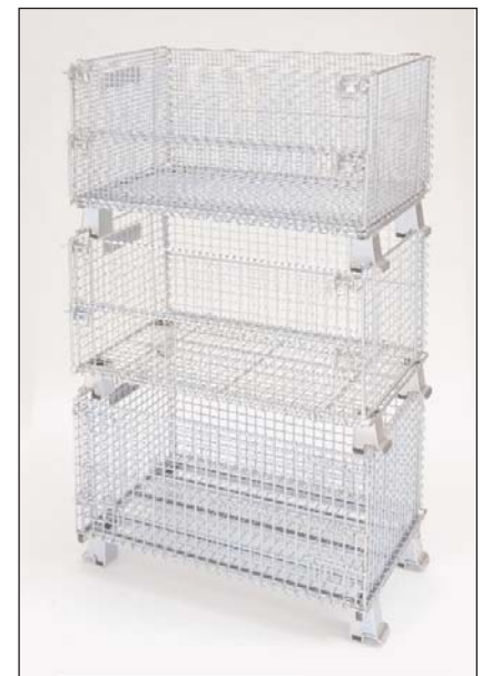
Right: AWP's Wire Mesh Folding Junior Containers stacked 3 high. Note the stronger channel base on the bottom container to yield 1,100 pounds capacity.