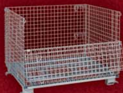
Wire Mesh Containers