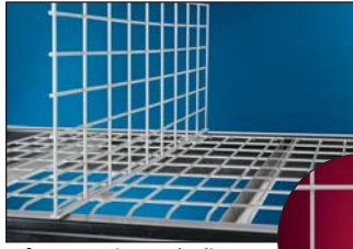
Above: Wire mesh clip-on divider and close up of installation clip.